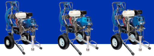
GMAX II ProContractor 3900 5900 (5900 HD) 7900 (7900 HD)