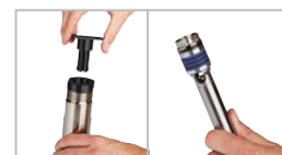
Remove disposable clip