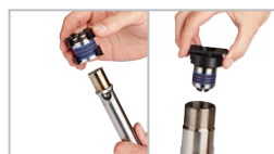
Insert pre-oiled packing cartridge assembly